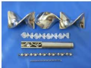
different Mixing Elements