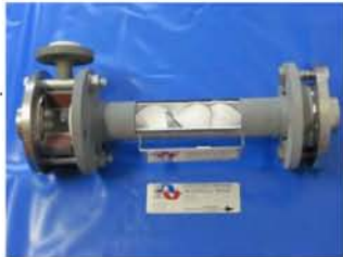
PTFE Mixer with Injector