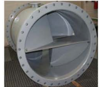
Mixer DN 1200 with Rilsan coating