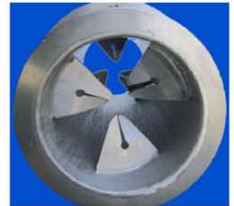
antiblocking Static Mixer

C-Steel, Stainless Steel Titan, Alloys, Hastalloys, Inconels, PP, PVC, PE, HDPE, PTFE, PVDF, Ceramics, Glass